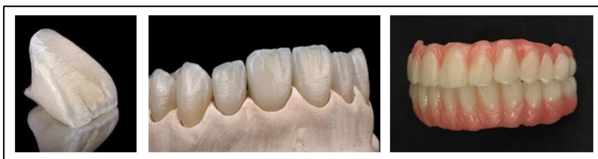
Fig. 4. Various indications of G-CAM disc

Glass ionomer cement is a tooth-coloured material and a major drawback of using rGO in dental materials such as GIC is its dark colour. Sun et al. attempted the addition of fluorinated graphene (FG) (Fig. 5) to conventional GIC which resulted in a compound that is white with significantly improved mechanical, tribological, anti-bacterial properties, enhanced Vickers hardness number (VHN), Compressive strength, and improved oral solubility [31]. The existence of fluoride ion ( F^- ) leads to the production of fluorapatite which because of its stable structure resists acid dissolution better than hydroxyapatite. Pure GICs have the highest accumulated F^- releasing in the early stage (during the first month), which is because of their fastest dissolution rate. The addition of FG decreased the solubility of the GICs composites, so F^- -releasing was relatively lower. The GICs/FG (4 wt%) composite had similar performance with other FG-added groups at initial stage, but then the F^- release increased rapidly due to the accelerating of dissolution. Soon the GICs/FG (4 wt%) composite has the most F^- releasing [31]. Sharafeddin et al in their study reported that the addition of GO to CGIC has no significant effect