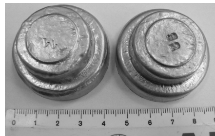
Fig. 1. Samples for testing the alloy porosity content

As the alloy was prepared in the melting furnace, it was heated up to 720 °C and the